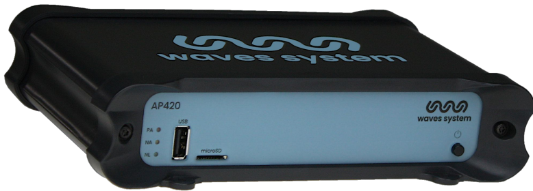
AP420/AP420 Wireless +

The most handy range of audio sources for background music and messages