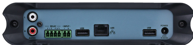
AP420/AP420 Wireless +