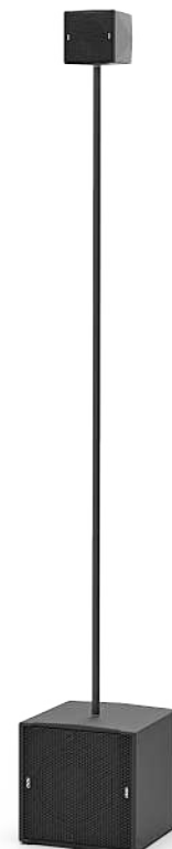
IDS108 deployed with ID14 and thin pole accessory.

The IDS108 shares the same phase response as other NEXO speakers, making it extremely easy to mix with other NEXO systems, e.g with the larger MSUB18 or with other NEXO subs, without risk of comb filtering or requiring complex electronic adjustment.