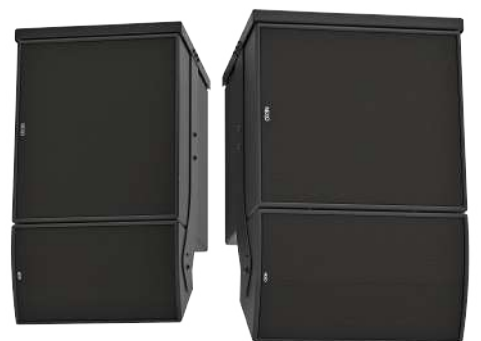
eLS18 coupled with ePS10 (left) and ePS12 (right).

The eLS18 shares the same phase response as other NEXO speakers, making it extremely easy to mix with other NEXO systems, or when used with any NEXO subs, without risk of comb filtering or requiring complex electronic adjustment.