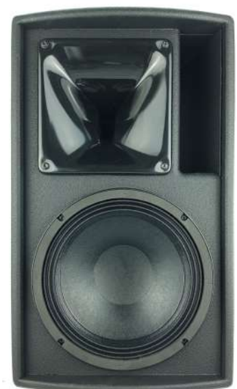
Grille removed, the large PS horn used with the HF driver

ePS10-EN54 acoustic phase response is NEXO phase signature allowing inter-operability between all NEXO speakers at all crossover points, except for the monitor setups where latency is minimized.