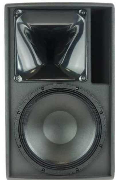
Grille removed, the large PS horn used with the HF driver

rce23 np"984p fiun& "r&fi"z& v&aNkb fiun& &tzn9"r n&x @zt v4".fir"now&G or @rz n&x aNkb 8firnw"&n4nx p""8&:r" fi"v& rBpfi4s" 4r y "z4" & 9fi&@r"r n4z pG&y v&y v&R q/