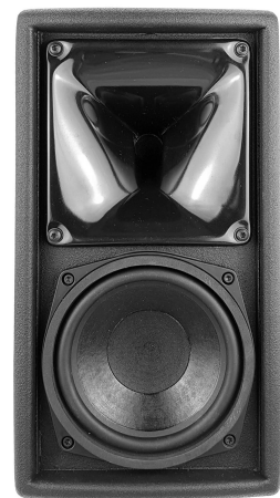
Grille removed, the large PS horn used with the HF driver

ePS6-EN54 acoustic phase response is NEXO phase signature allowing interoperability between all NEXO speakers at all crossover points, except for the monitor setups where latency is minimized.