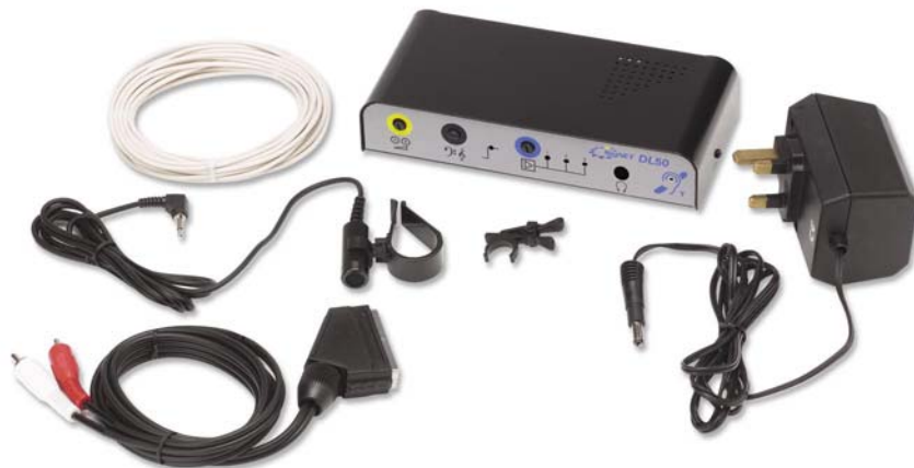
DL50/K kit contents ▲