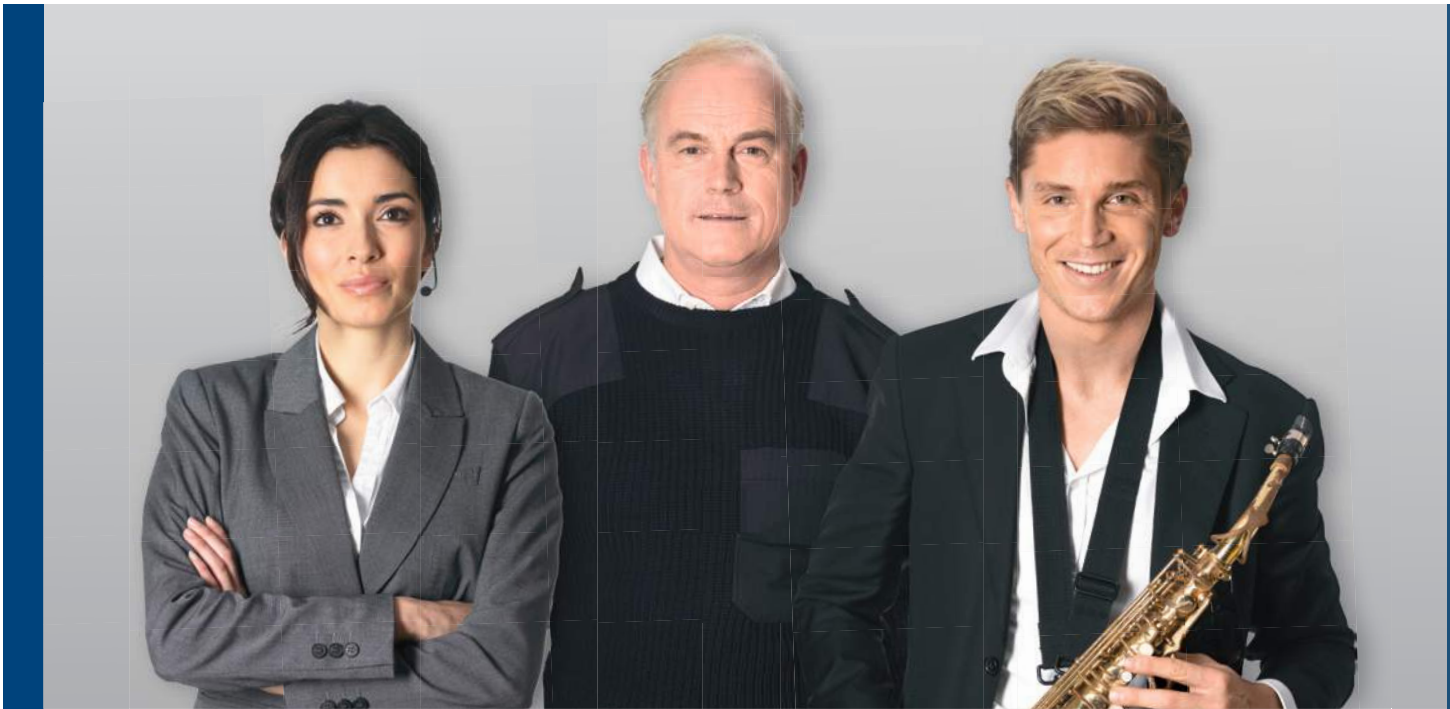
PAVIRO: Public Address, Voice Evacuation, Professional Sound Quality